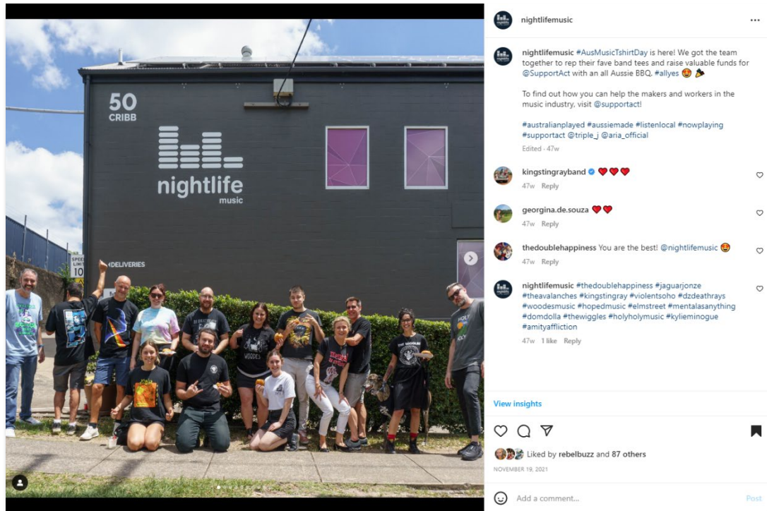
Nightlife Music's post for #ausmusicshirtday2021 [Instagram]

To learn more about Ausmusic T-shirt Day, visit the Support Act website here .