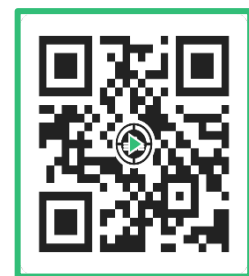
1. Download crowdDJ

Don't stop there, though! You're only halfway.